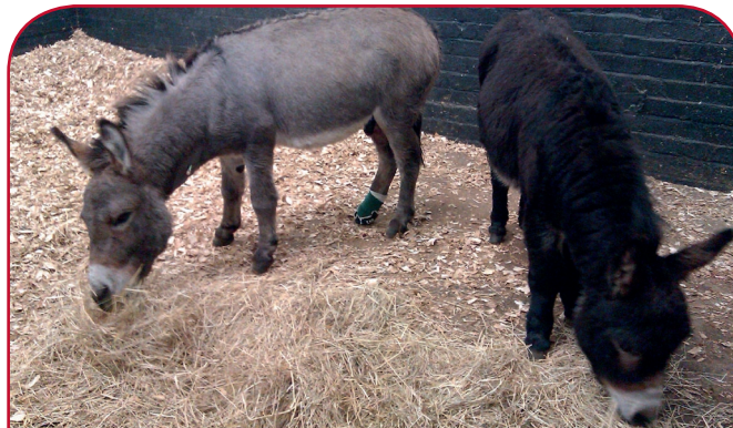
DONKEY HOSPITALISED WITH BONDED COMPANION