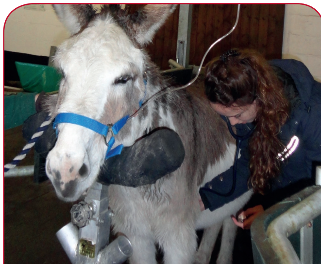
INTRAVENOUS FLUID THERAPY