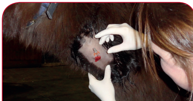
INTRAVENOUS CATHETER PLACEMENT