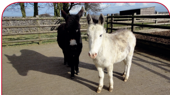
STRESS E.G. SEPARATION ANXIETY, CAN BE A TRIGGER FACTOR