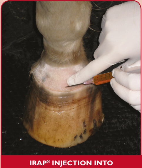
IRAP® INJECTION INTO THE COFFIN JOINT

Once prepared, the sterile solution of irap®, called autologous conditioned serum (ACS) can then be used to block the action of IL-1 and help alleviate pain and reduce lameness.