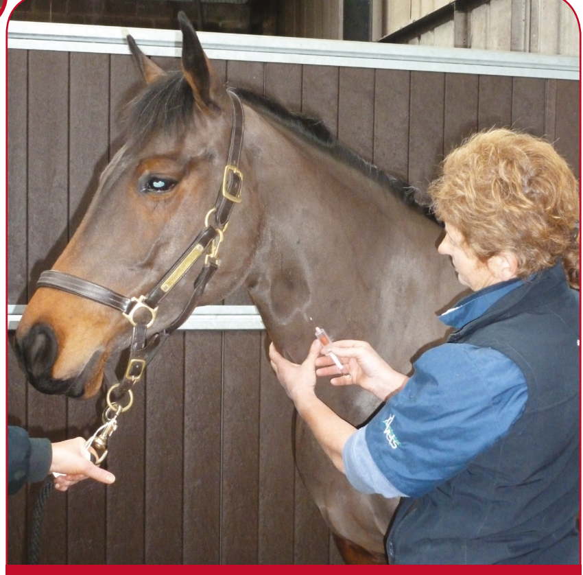
IRAP® IS PRODUCED FROM THE HORSE'S OWN BLOOD