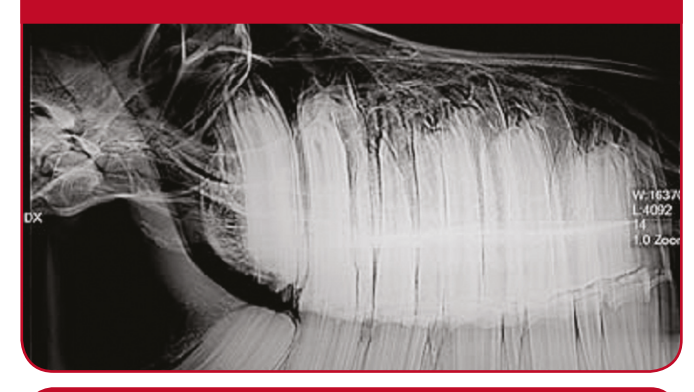
'KISSING SPINES' OR OSTEOARTHRITIS MAY BE FOUND ON AN X-RAY OF THE BACK

X-RAYS OF THE TEETH CAN HELP TO DIAGNOSE DENTAL DISORDERS