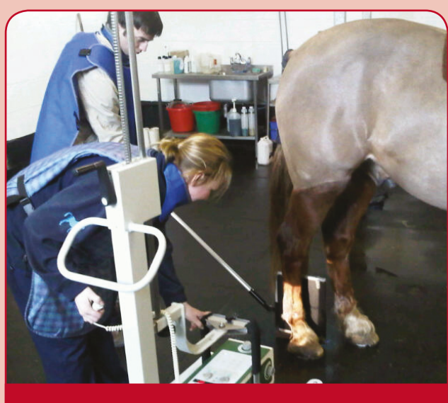
TAKING A FETLOCK X-RAY