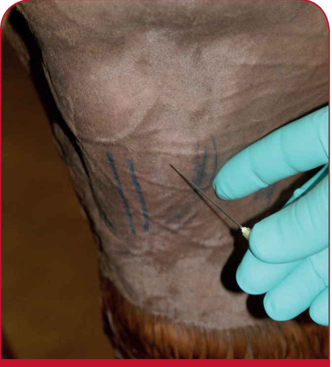
PLACEMENT OF A NEEDLE INTO THE LARGE COMPARTMENT IN THE STIFLE JOINT

The stifle is a large, highly mobile joint with three distinct compartments, lameness associated with this joint is common in all ages of horse.