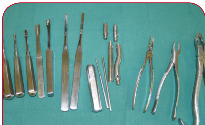
INSTRUMENTS USED FOR WOLF TOOTH REMOVAL

After removal, horses should be given tetanus antitoxin (if not vaccinated) and a period of time off work without a bit being placed in the mouth. This will vary depending on the size of wolf tooth removed but may be as long as ten days.