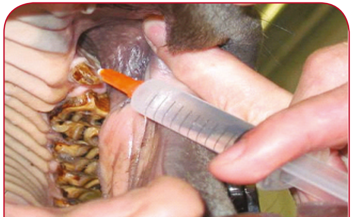
LOCAL ANAESTHETIC BEING INJECTED AROUND A WOLF TOOTH

The risks of root fracture and artery damage can be minimised by effective sedation and local anaesthetic.